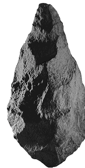
Fig.1. Olduvai Canyon Choppers

Second, the diversity development of stone tools completely satisfied human's basic survival needs when human society developed into polished stone in the Neolithic. However, as psychologist Abraham Maslow proposed in 1943, a pyramid of hierarchical human motivational needs: once the needs of the first level are met, humans will pursue higher-level requirements (Zhang, 2011; Taormina and Gao, 2013). Figure 2 shows the stone plate unearthed from Pei Li Gang in Xinzheng prefecture, Henan province, which was used to make processed food for civilians originally. This stone is a processed stone plate, which was manufactured after repeated practice on a variety of stone tools by original inhabitants. In fact, there was no long oval stone plate in earlier food processing since people were often scratched by sharp edges when stone tools are used. Given the users' security, the long sleek stone rods was altered or manufactured from the rough stone in early times. As a result, a new behavior manifestation form was accumulated and discovered to guarantee the security, which indicates a period that manner of use design is a part of the security attributes of design category.