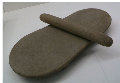
Fig.2. Unearthed Stone Plate